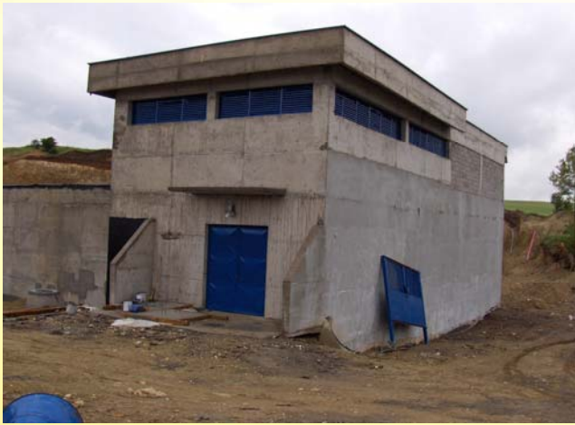
Photo 1-Water reservoir