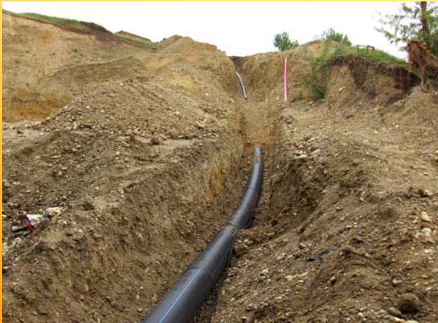
Photo 3-Supply pipeline from a filter station to a reservoir