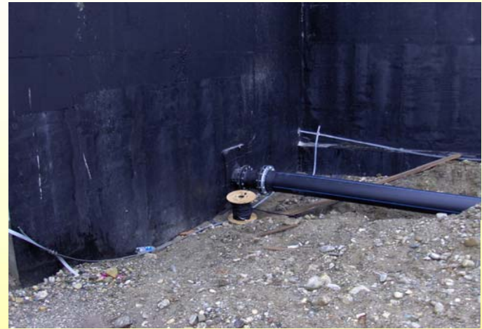
Photo 2- Input of supply pipeline into a reservoir