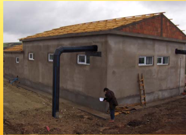
photo 4-Filter object with chlorine station